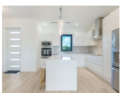
PHASE 2- PARAISO RESIDENCES, a remarkable lifestyle right on the water connecting all water enthusiasts to the North Sound. These oversized-modern townhomes feature 3 bedrooms/3.

Location: Prospect MLS: 417640 Built: 2025