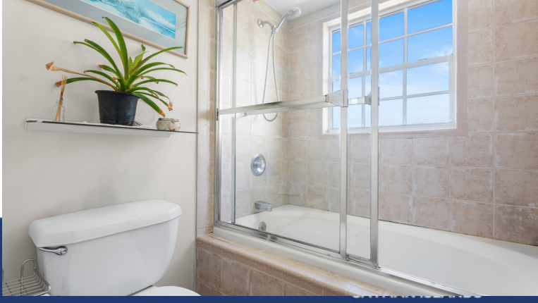
2024 © RE/MAX Cayman Islands. All rights reserved. Proud member of CIREBA.