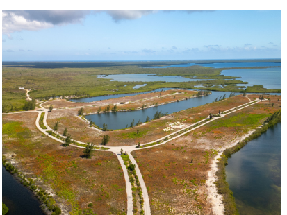
SELLER PAYS THE STAMP DUTY, BUYER PAYS NO STAMP DUTY Welcome to Rum Point Harbour! An incredible new canal front community just steps away from the very best beaches, restaurants and resorts in the highly sought after Rum Point district. These large waterfront parcels are ready to build your dream single family home or duplex! These home sites range in size and price from 0.