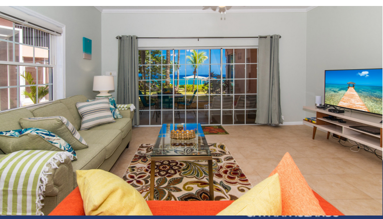
2024 © RE/MAX Cayman Islands. All rights reserved. Proud member of CIREBA.